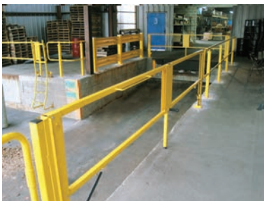
Loading Dock Gates